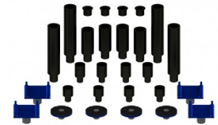
Extensions and lifting pads adapters