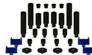
Extensions and lifting pads adapters