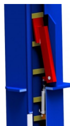
Automatic load holding system