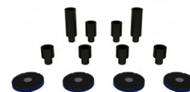
Extensions and lifting pads adapters