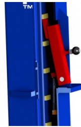
Automatic load holding system