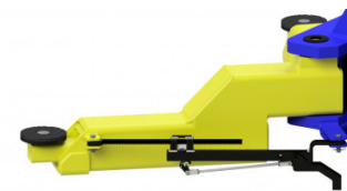
Automatic swing arm restraint